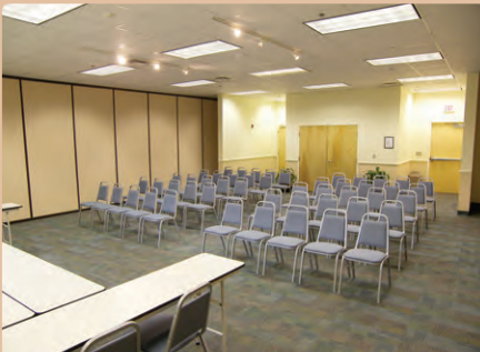
West Village, Town Hall Activity Room, Catering Kitchen, Meeting Room 102, Meeting Room 103, Meeting Room 104, Conference Room 851 Celebration Avenue