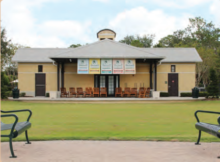
Celebration Village Lakeside Park, Jones Room and Kitchen 611 Sycamore Street