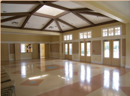
South Village Heritage Hall 951 Spring Park Loop